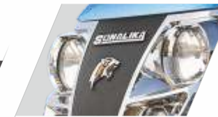
Twin Barrel Headlamps