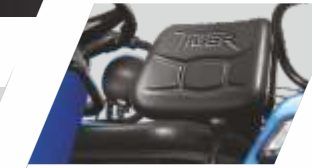
Plush Branded Seats 4-Way Adjustment