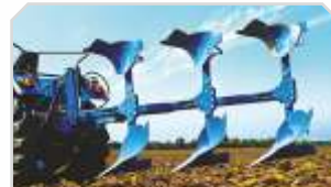
3 MB Plough