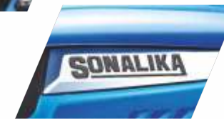
Premium Chrome Trims