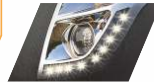
Super Luxe DRL