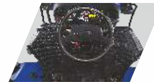
XL W-i-d-e Workspace