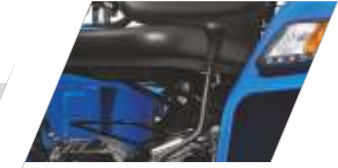
High Stance Seating 180 Degree View