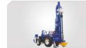
Drilling RIG Attachment