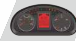
Luxurious Multi-function Console