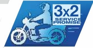
3x2 Service Promise Technician within 3 hours at your door step Complaint Addressal within 2 Days

The Sonalika Tiger series is a first-of-its-kind tractor designed in Europe and made in India to match the needs of young Indian farmers. Built with latest technological features, it is ideal for high-end agricultural applications. Sonalika Tiger series is all set to rule the future of precision farming in India. Call 1800 102 1011 to book your test drive.