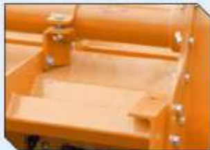
Robust structure for heavy vibration free field operation-Tubular square pipe on front & rear with angle iron welded on both sides