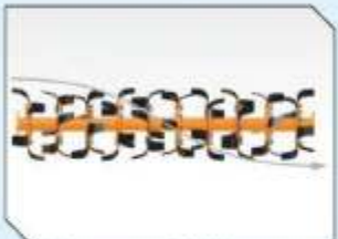
Helical arrangement of blades ensures less load on tractor & lesser fuel consumption.