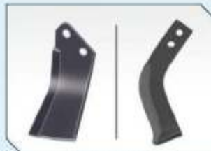
Available with L&J type boron steel blades.