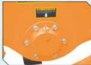
Oil immersed side bearing