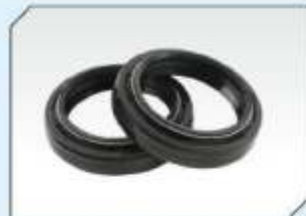
Duo cone mechanical oil seals ideal for dry & wet land operation.