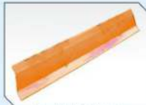
Heavy duty trailing board.