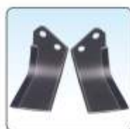
International Quality Boron Steel Anti Wear Blades