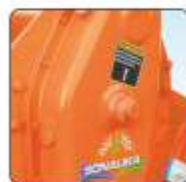
Double Support Idler Gear