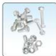
High Tensile Bolt Fasteners