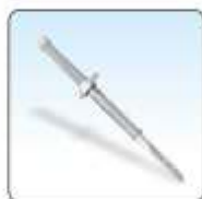
Flexible Adjustable Trailing Spring