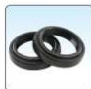
Duo Cone Mechanical Oil Seal