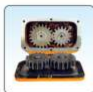
Four Speed Gear Box