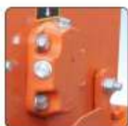
Oil Immersed Side Bearing