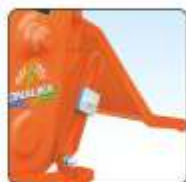
Precise depth adjuster