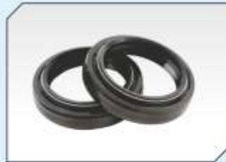
Duo Cone mechanical oil seals ideal for dry & wet land operation.