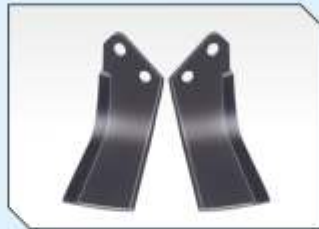
Available with L & C type boron steel blades.