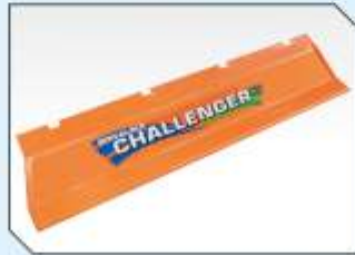
Heavy duty z type trailing board.