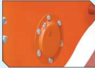
Oil immersed side bearing