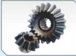
Bigger & strong crown & pinion.